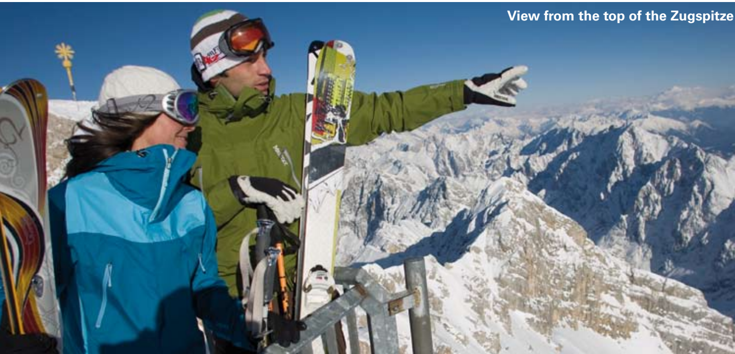
View from the top of the Zugspitze

Combine your Munich City Trip with Winter Excursions to the nearby Alps. Further Information about the City of Munich: www.muenchen-tourist.de