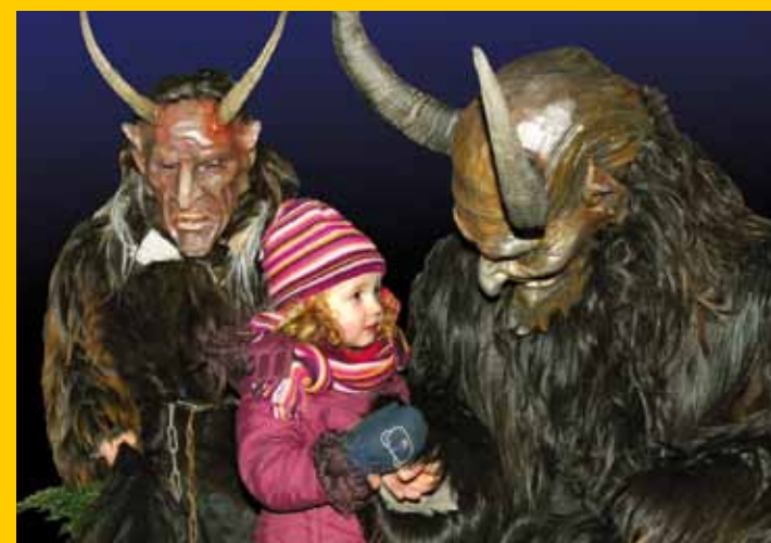
Krampus Run with the Group "Sparifankerl Pass"