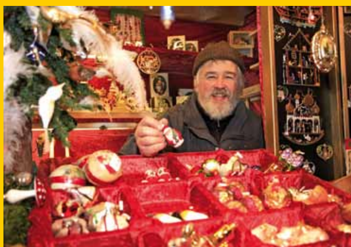
Nostalgic Christmas Tree Decoration made of Pewter and Glass