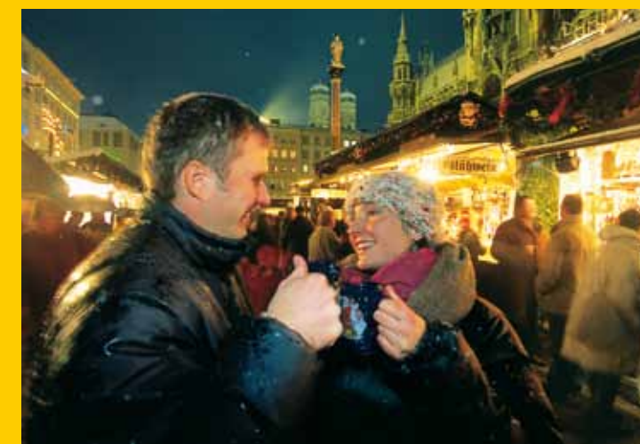
At Marienplatz Square