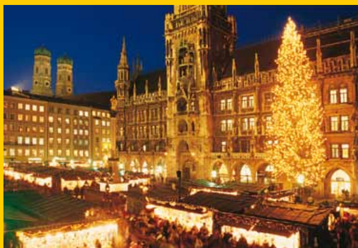
Popular Meeting Place: The Christmas Tree at the Munich Town Hall

Tours can be booked for groups only at the Tourist Office: gf.tam@muenchen.de , facsimile +49 (0) 89 233-30 337 Information: Phone +49 (0) 89 233-30 234 or -30 204