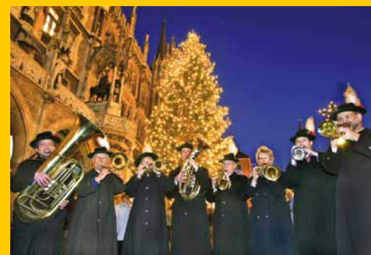
Festive Seasonal Music with the "Isartaler Blasmusik"